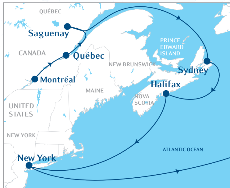
Transatlantic, from/to Europe