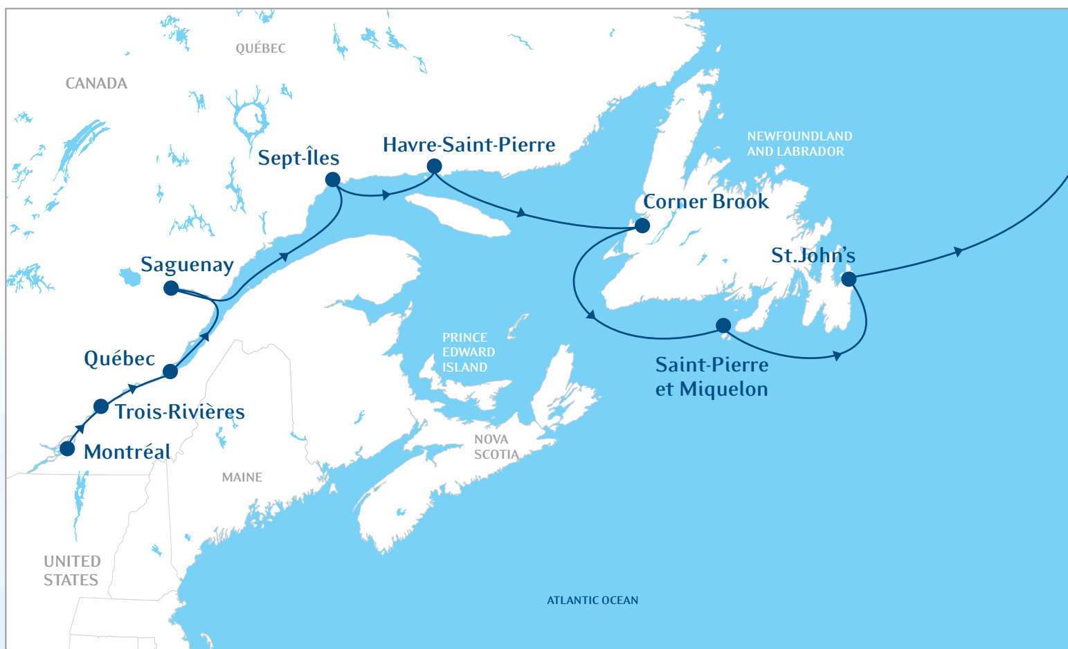
Transatlantic, from/to Europe