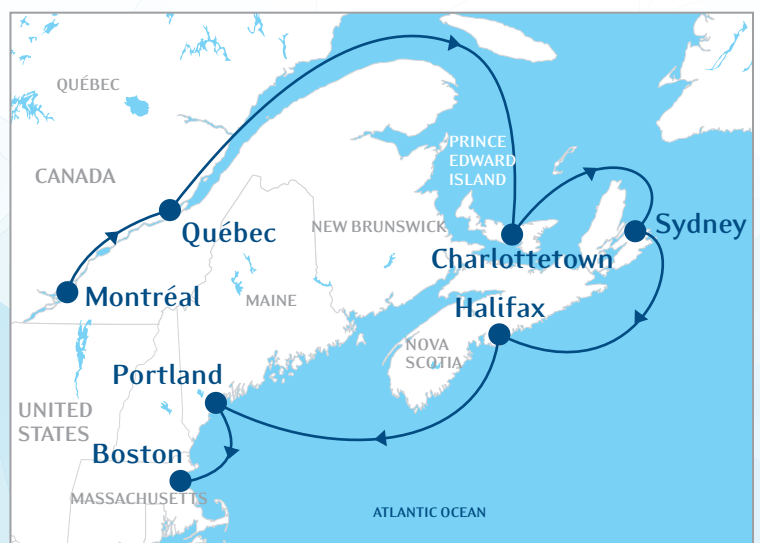
Montréal–Boston, one-way trip (round trip also available)