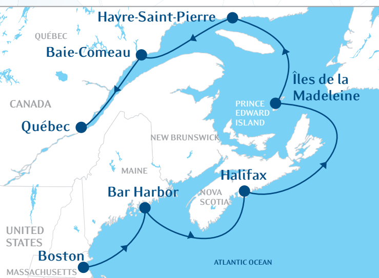
Boston–Québec, one-way trip (round trip also available)