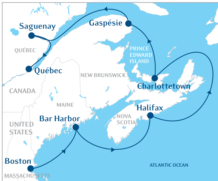
Québec–Boston, one-way trip (round trip also available)